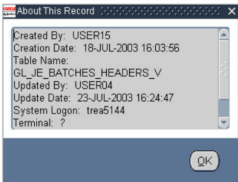
Figure 3: Examining the record history for a transaction

As a default, Oracle keeps a certain level of history for each transaction entered in the system. If you are reviewing a particular transaction simply choose Help > Record History on the menu and the information shown in Figure 3 below will appear. This is very useful in trying to determine who was responsible for entering or modifying a particular transaction and can also be used to determine which table a transaction is being read from.